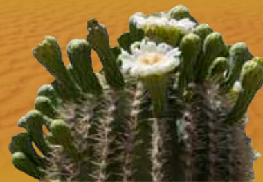
EXHIBIT WITH NAPR & NALTO IN ARIZONA!